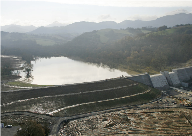
Dam during filling tests