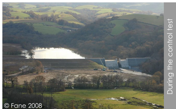
During the control test