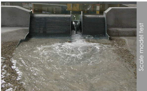
Scale model test