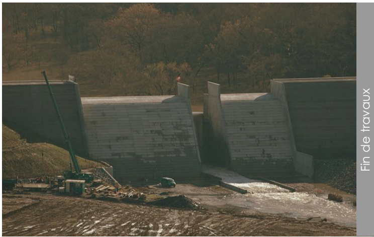
Fin de travaux

Consortium: Sogreah (leading partner) - ISL - SARL Andusa